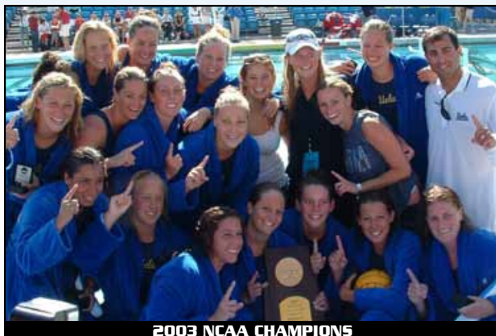
2003 NCAA CHAMPIONS