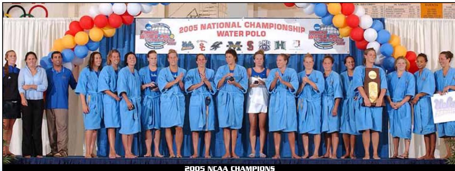
2005 NCAA CHAMPIONS